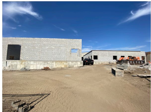
Construction Progress at Hartford Elementary